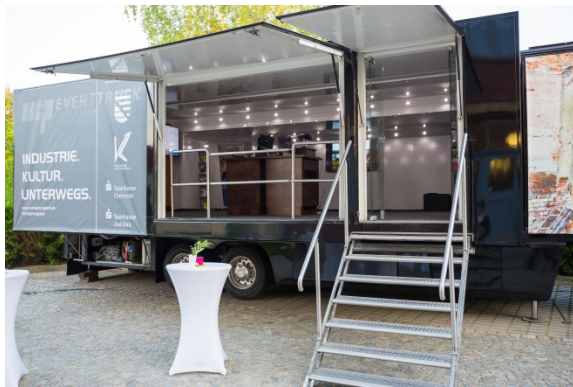
(author: Krauß Event Zwickau)

All in all, the installation represents the regional industrial past as the visitor can virtually visit industrial museums, it represents current regional industry as the visitor can virtually visit regional production, and it represents the regional industrial future because it is a virtual exhibition and it uses the industrial robot “Mobi” as a symbol for “industry4.0”.