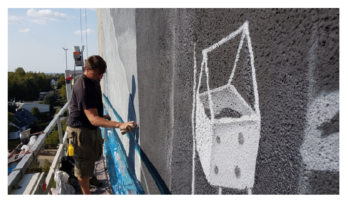
The artist at work on the hanging platform.