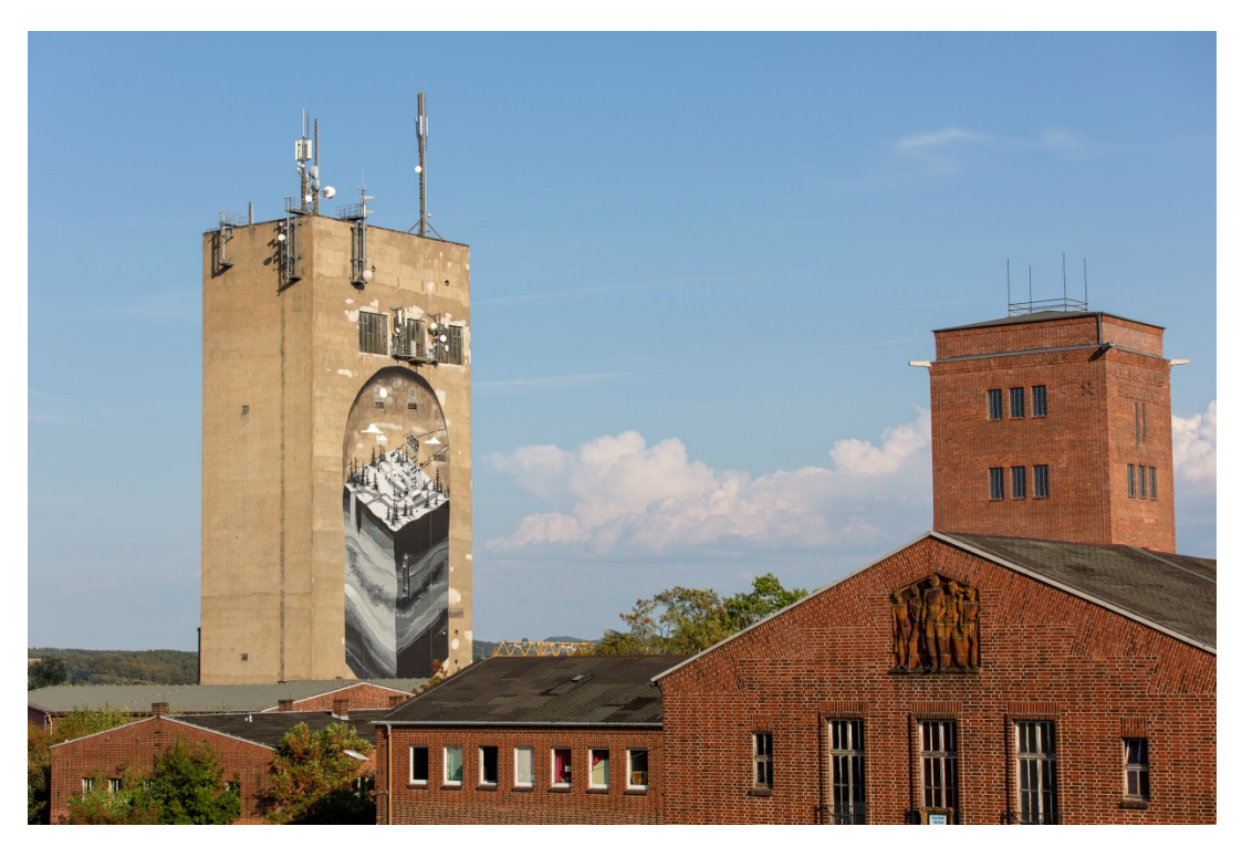
The mural, seen from the crossroads outside the MSB premises at the day of the Vernissage.