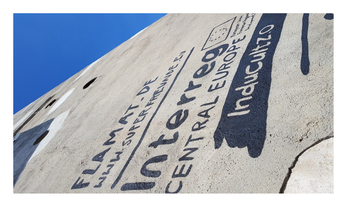
The InduCult2.0 logo in a close-up (author: Carsten Debes).

The process of bringing the art work onto the wall was also documented on film. The video includes comments by the shaft owner Mr Zampieri and the artist Flamat. The film by Sascha Quade of the initiative "So geht Sächsisch" is published on the "So geht Sächsisch" webpages <a href="https://www.facebook.com/sogehtsaechsisch/videos/2293316414232452/">https://www.facebook.com/sogehtsaechsisch/videos/2293316414232452/</a> and <a href="https://www.youtube.com/user/sogehtsaechsisch">https://www.youtube.com/user/sogehtsaechsisch</a>.