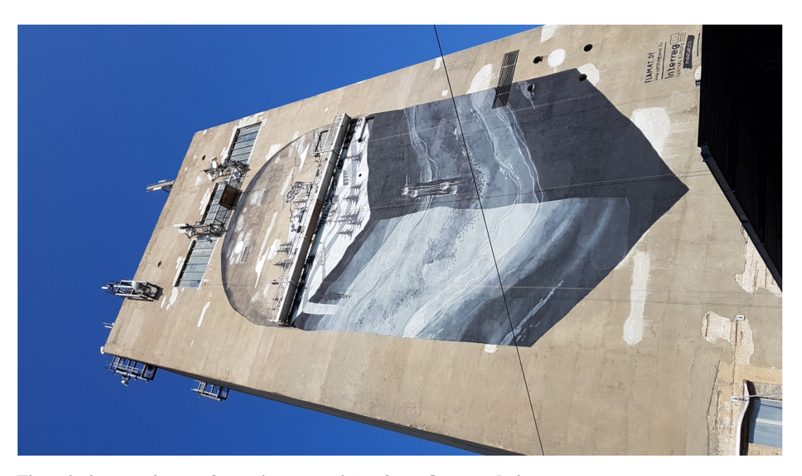
The whole mural seen from the ground (author: Carsten Debes).